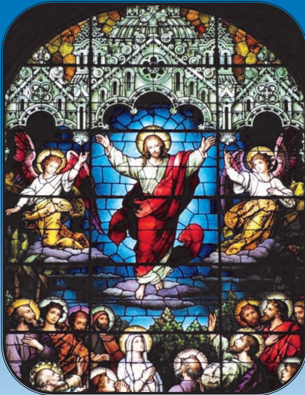
The Ascension Stained Glass Window St. Patrick Church

Serving the East Bayfront of Erie since 1837