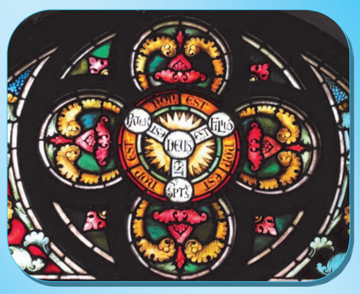
The Holy Trinity Stained Glass Window St. Patrick Church