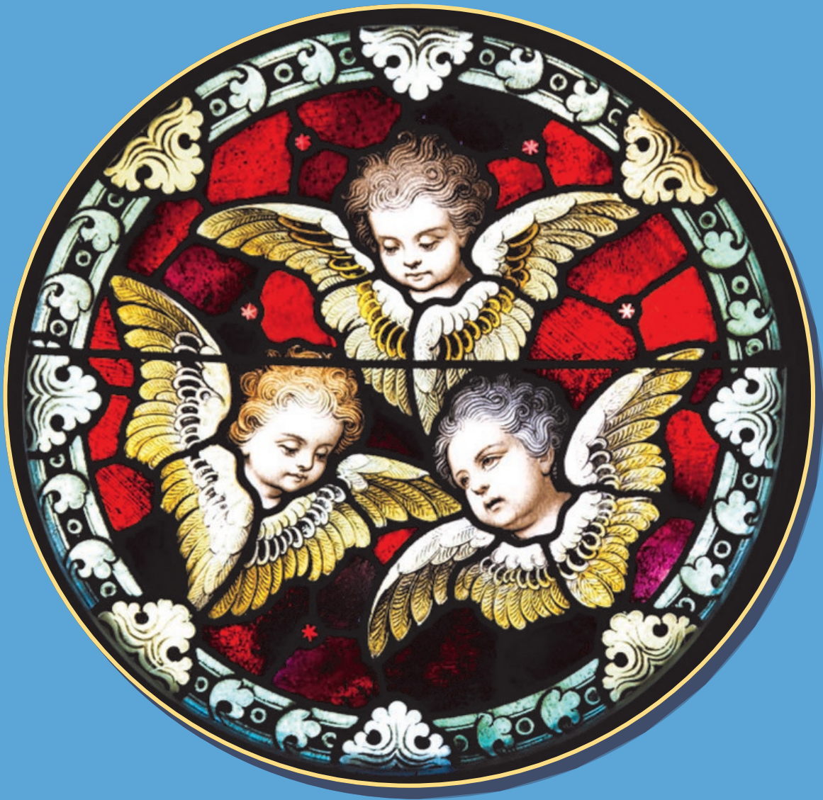
Stained Glass Window St. Patrick Church