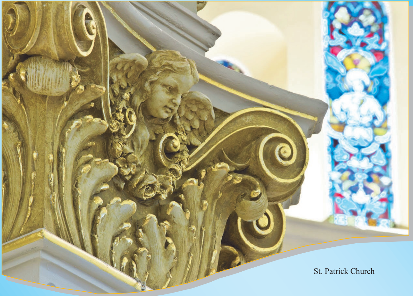
St. Patrick Church

Serving the East Bayfront of Erie since 1837