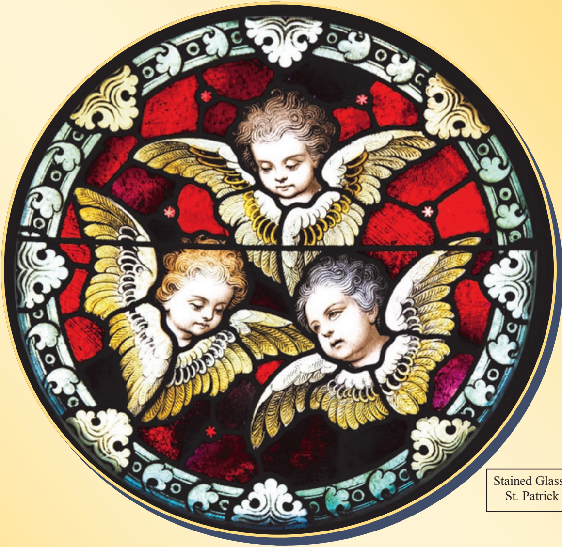
Stained Glass Window St. Patrick Church