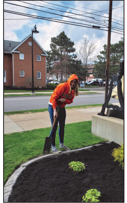
Community Service Day at St. Patrick Church by Villa Maria Academy students