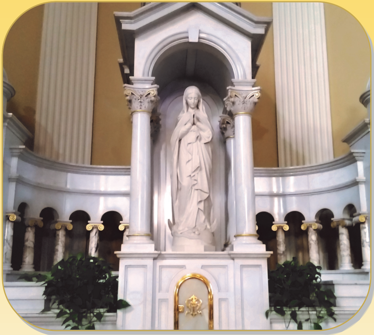
Mary's Altar St. Patrick Church