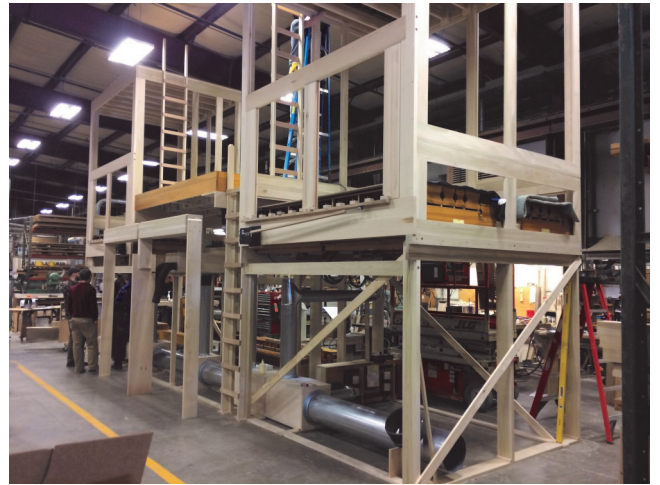
Organ Restoration Update Organ Supply Industries 2320 W 50th Street, Erie