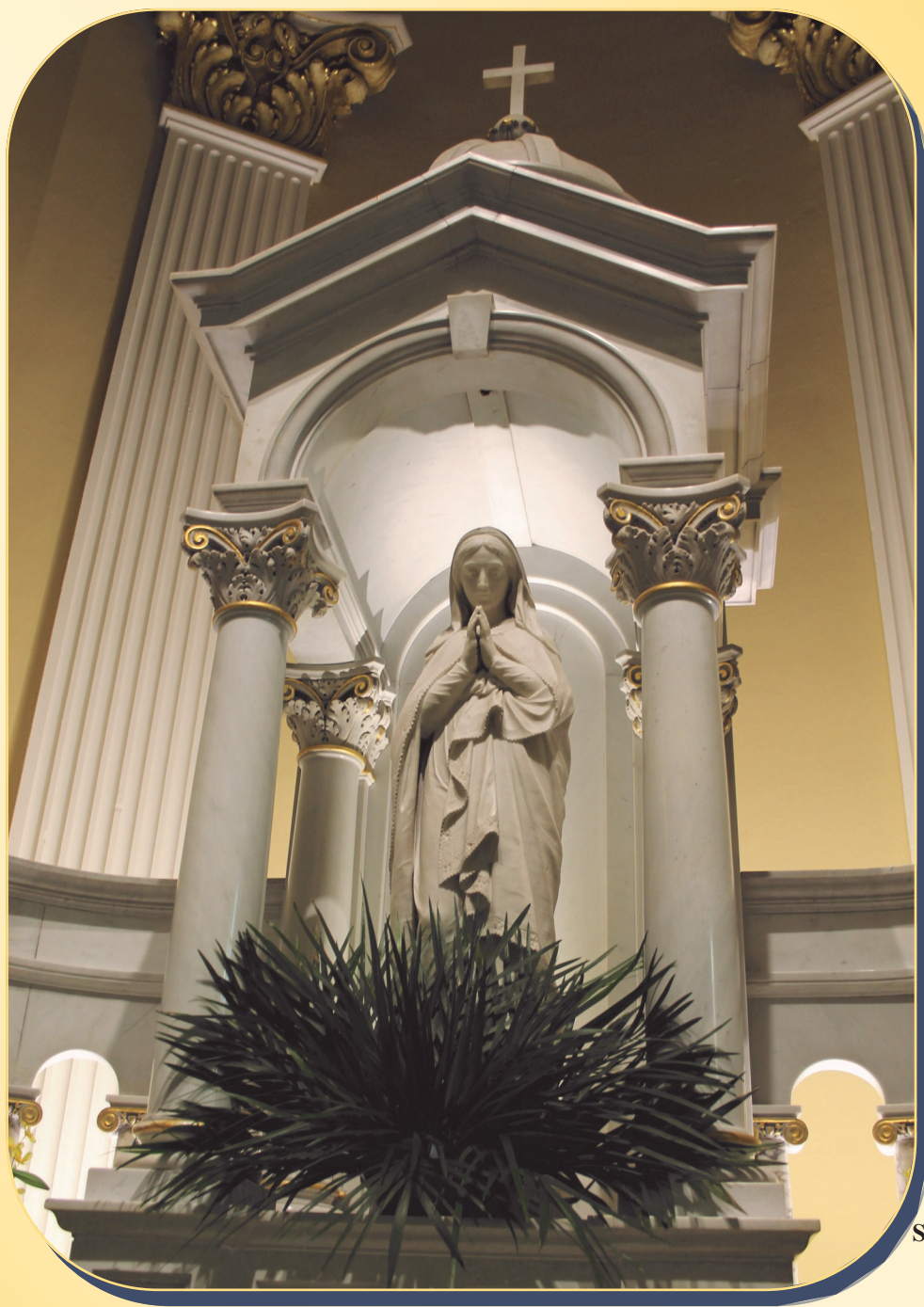
Mary's Altar St. Patrick Church