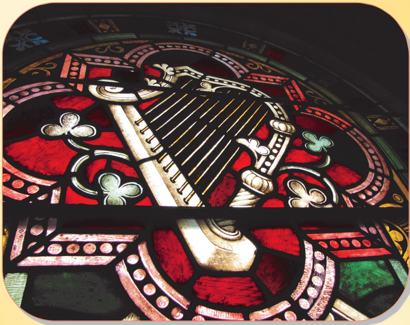
Harp Stained Glass Window St. Patrick Church

Serving the East Bayfront of Erie since 1837