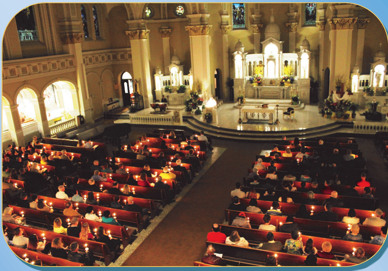
St. Patrick Church Easter 2019

Serving the East Bayfront of Erie since 1837