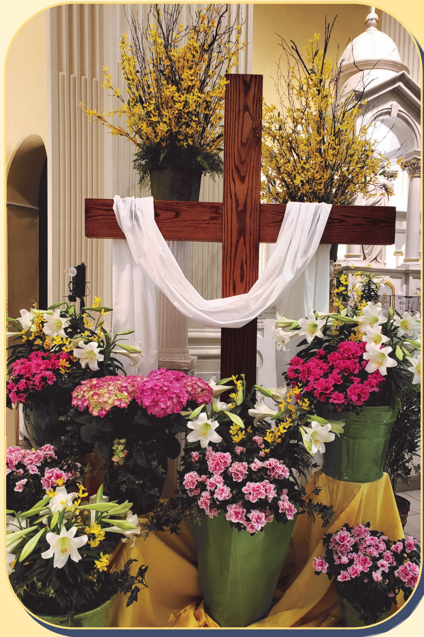
St. Patrick Church Easter 2019

Saint Patrick Parish Serving the East Bayfront of Erie since 1837 Daily Mass: Monday -Thursday 8 AM Saturday Vigil Mass: 5 PM Sunday: 8 AM & 10:30 AM