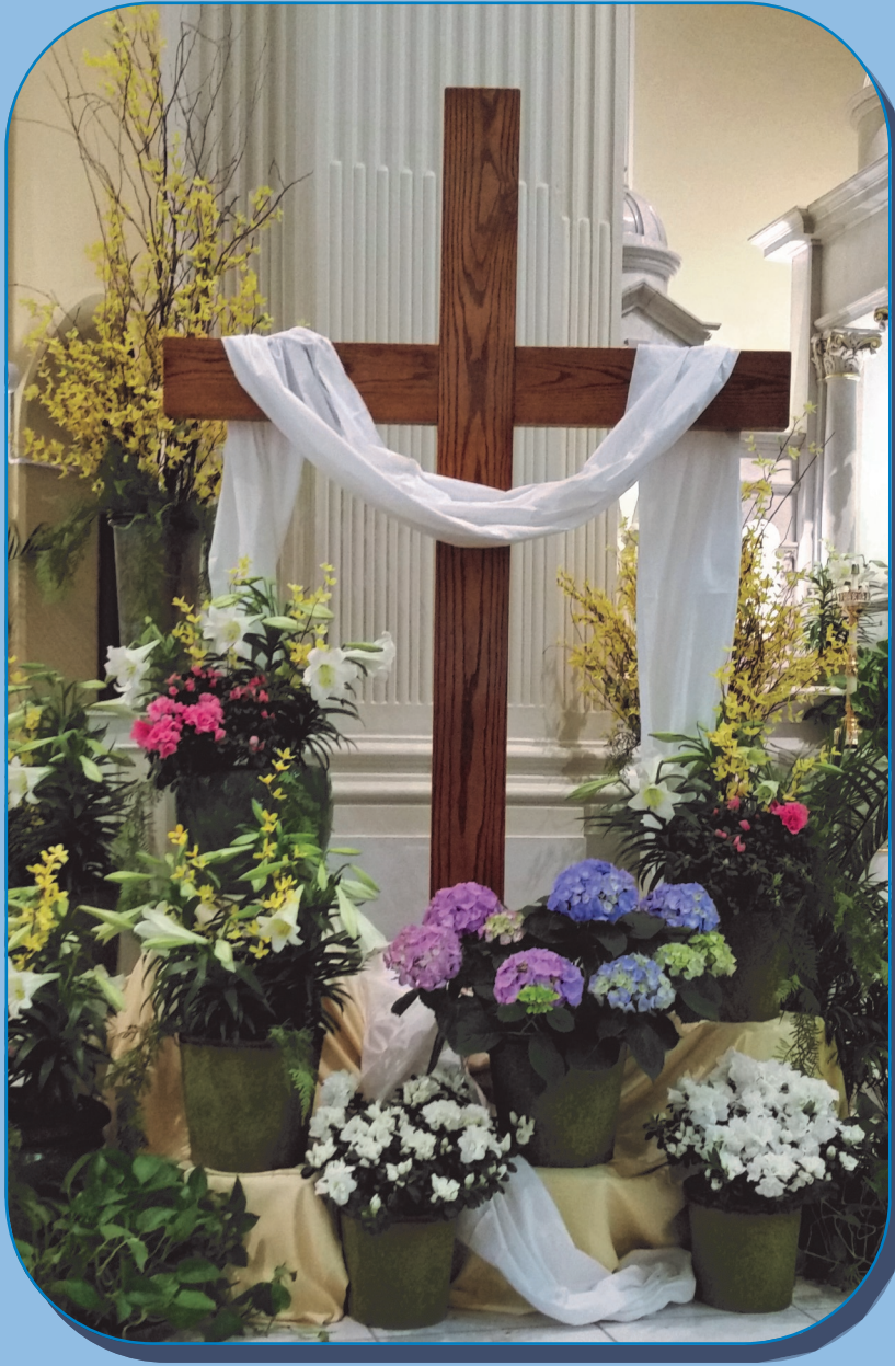
Easter Sunday St. Patrick Church Altar flowers by Allburn Florists

Serving the East Bayfront of Erie since 1837