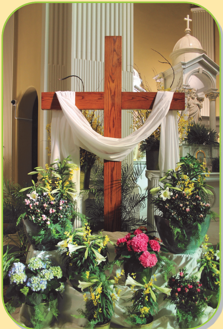
Easter at St. Patrick Church

Serving the East Bayfront of Erie since 1837