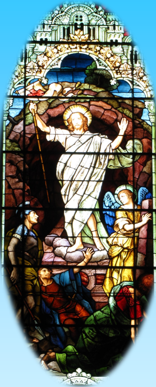
The Resurrection Stained Glass Window St. Patrick Church