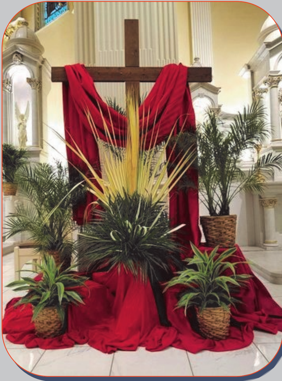
Palm Sunday St. Patrick Church

Serving the East Bayfront of Erie since 1837