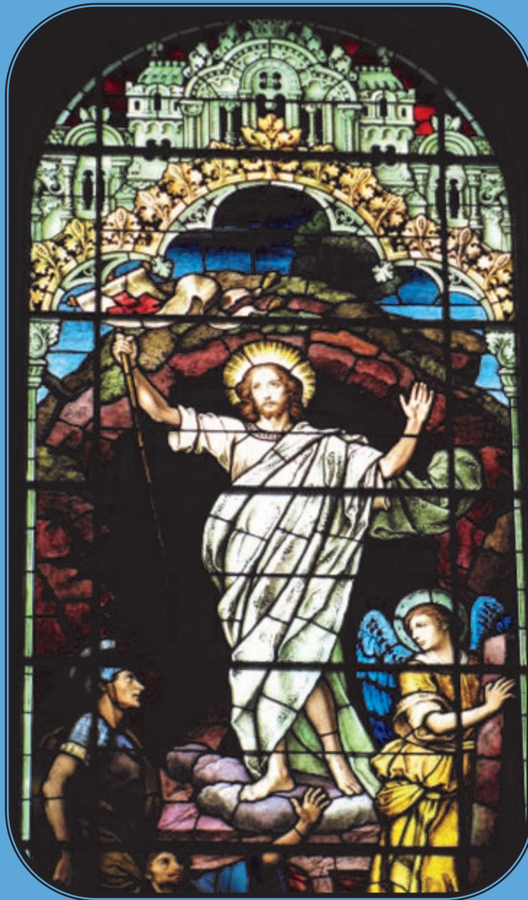
The Resurrection Stained Glass Window St. Patrick Church