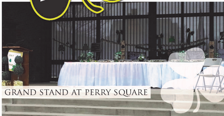
GRAND STAND AT PERRY SQUARE