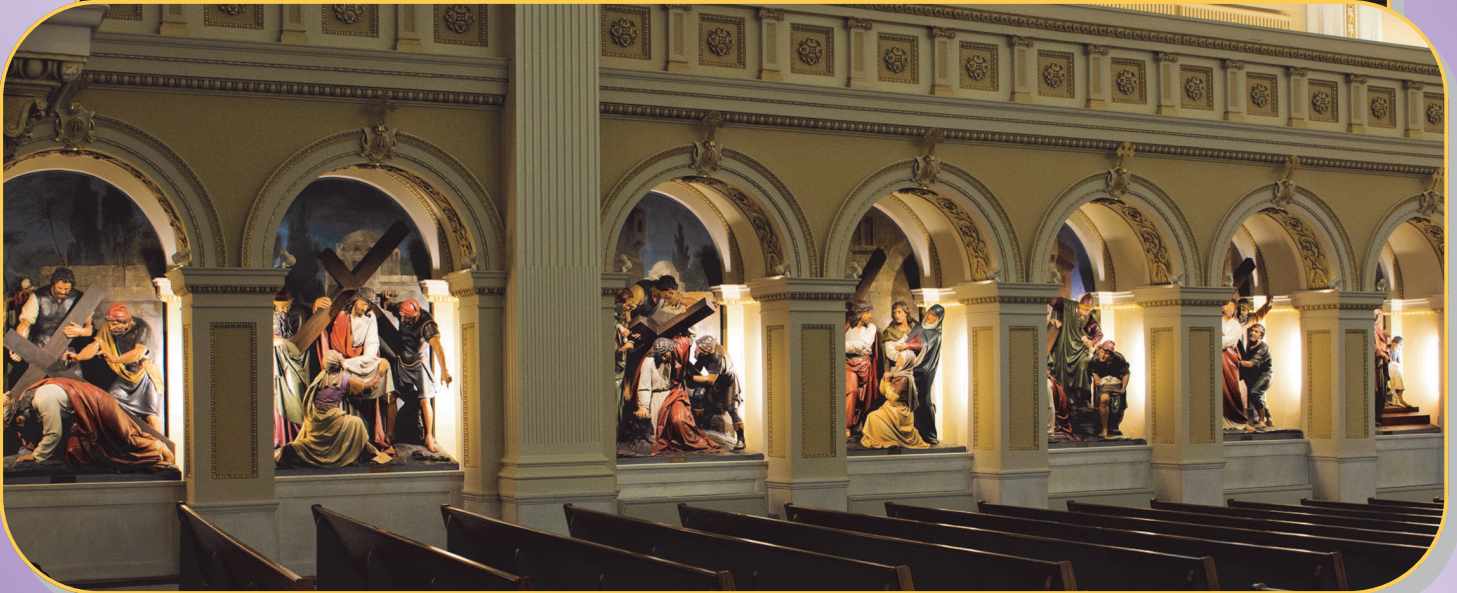
Stations of the Cross St. Patrick Church