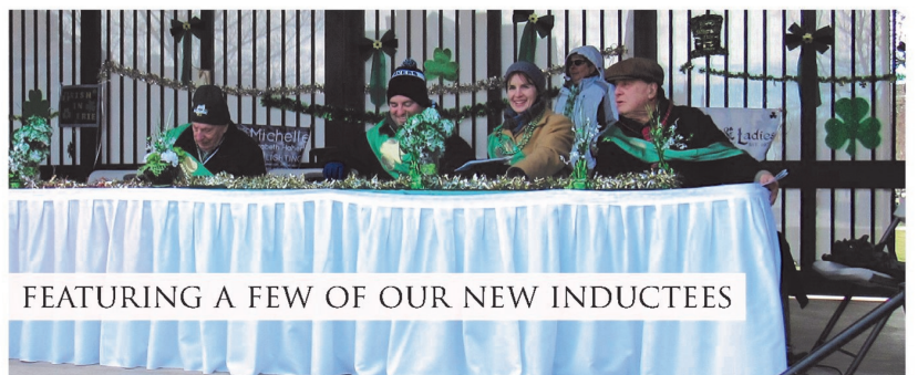
FEATURING A FEW OF OUR NEW INDUCTEES