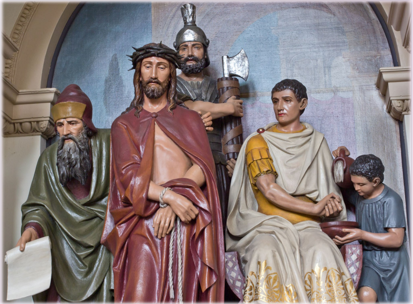
St. Patrick Church The First Station of the Cross "Jesus is condemned to die"

Serving the East Bayfront of Erie since 1837