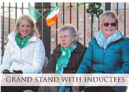
GRAND STAND WITH INDUCTEES