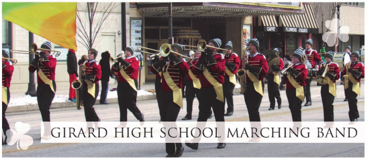
GIRARD HIGH SCHOOL MARCHING BAND