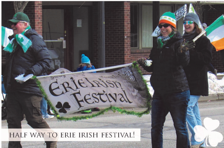
HALF WAY TO ERIE IRISH FESTIVAL!