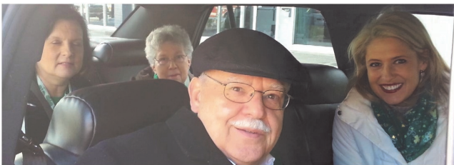
CONGRATULATIONS TO OUR 6 NEW INDUCTEES