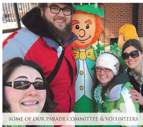
SOME OF OUR PARADE COMMITTEE & VOLUNTEERS