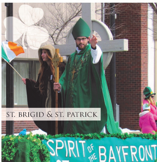
ST. BRIGID & ST. PATRICK