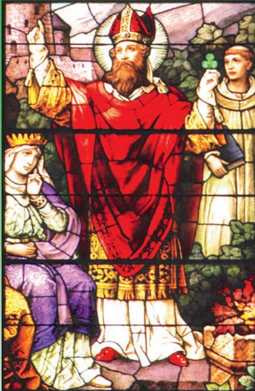
Stained Glass Window of St. Patrick St. Patrick Church

Serving the East Bayfront of Erie since 1837