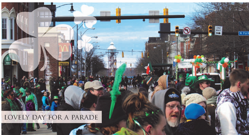
LOVELY DAY FOR A PARADE