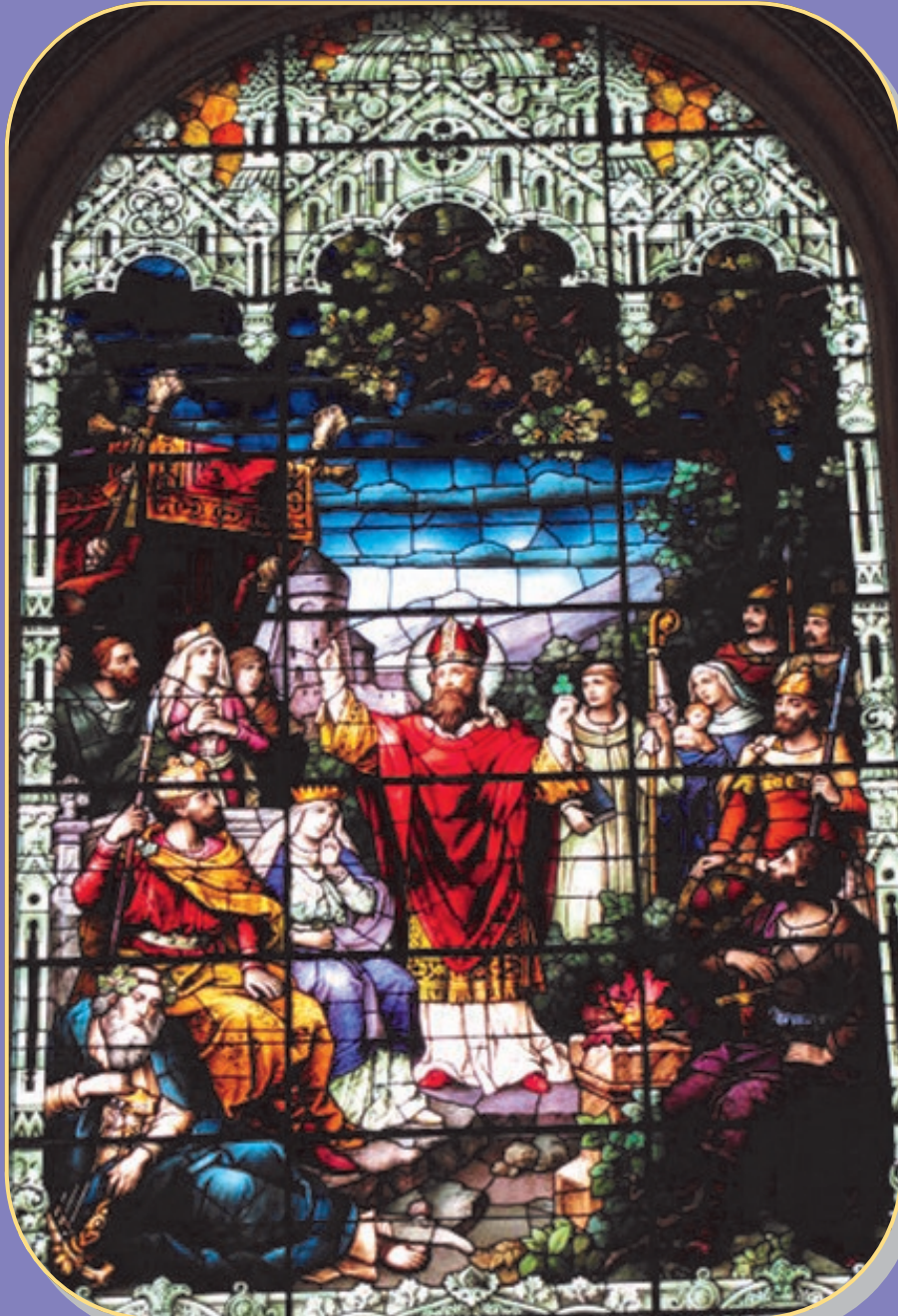
St. Patrick Stained Glass Window St. Patrick Church