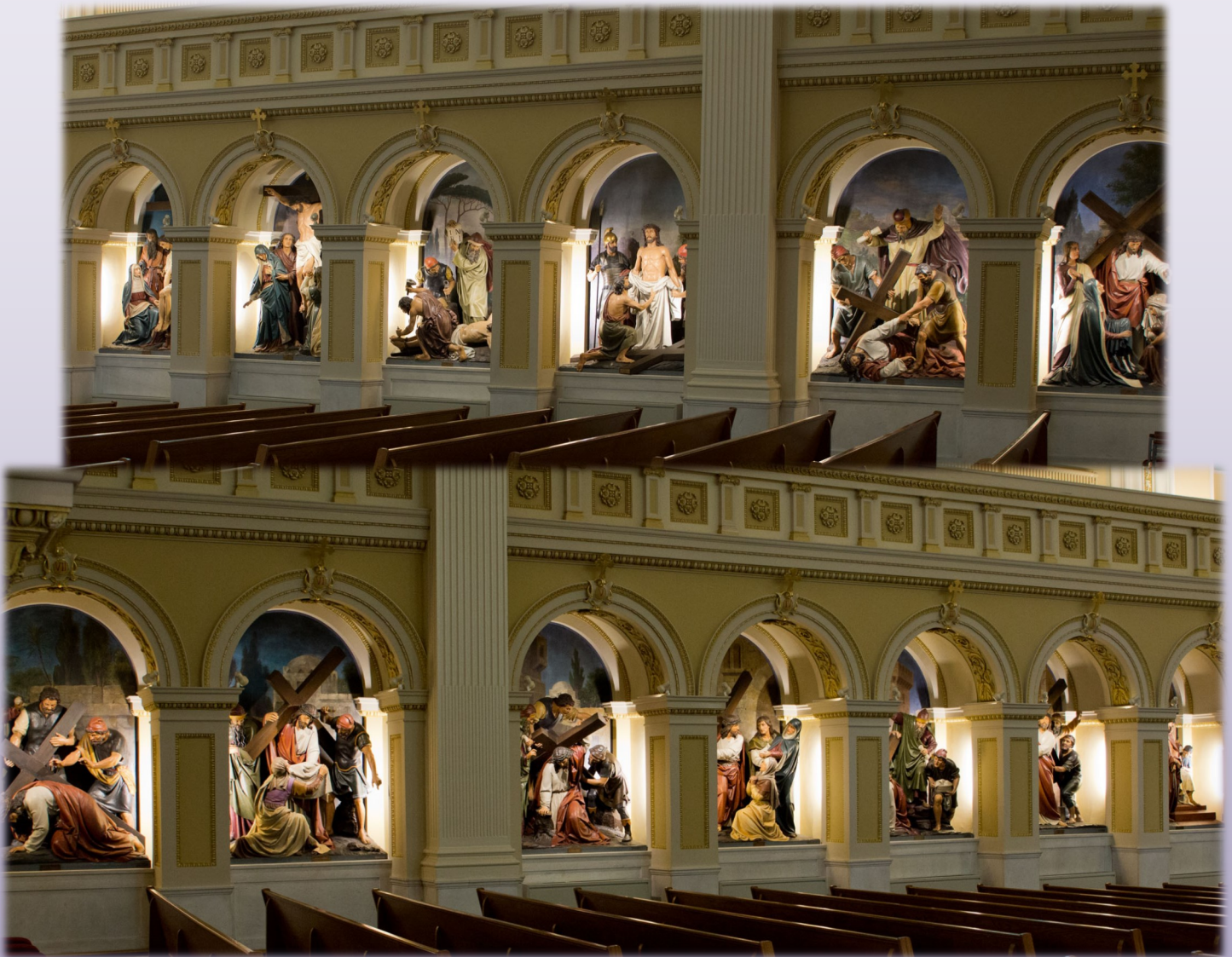
Stations of the Cross St. Patrick Church

Saint Patrick Parish Serving the East Bayfront of Erie since 1837 Daily Mass: Monday-Thursday 8 AM Saturday Vigil Mass: 5 PM Sunday: 8 AM & 10:30 AM