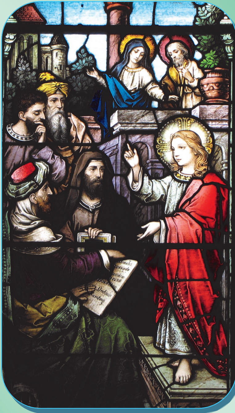
Stained Glass Window St. Patrick Church "All were amazed at His understanding and questions"

Serving the East Bayfront of Erie since 1837