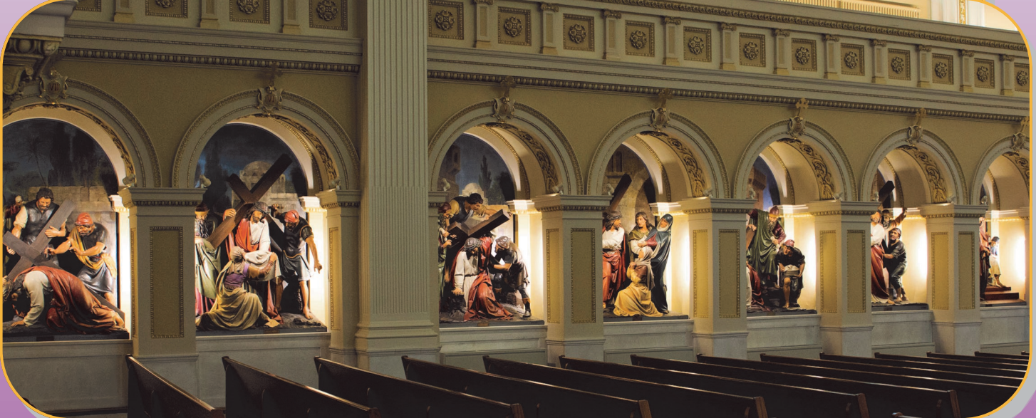
Stations of the Cross St. Patrick Church

Saint Patrick Parish Serving the East Bayfront of Erie since 1837 Daily Mass: Monday-Thursday 8 AM Saturday Vigil Mass: 5 PM Sunday: 8 AM & 10:30 AM