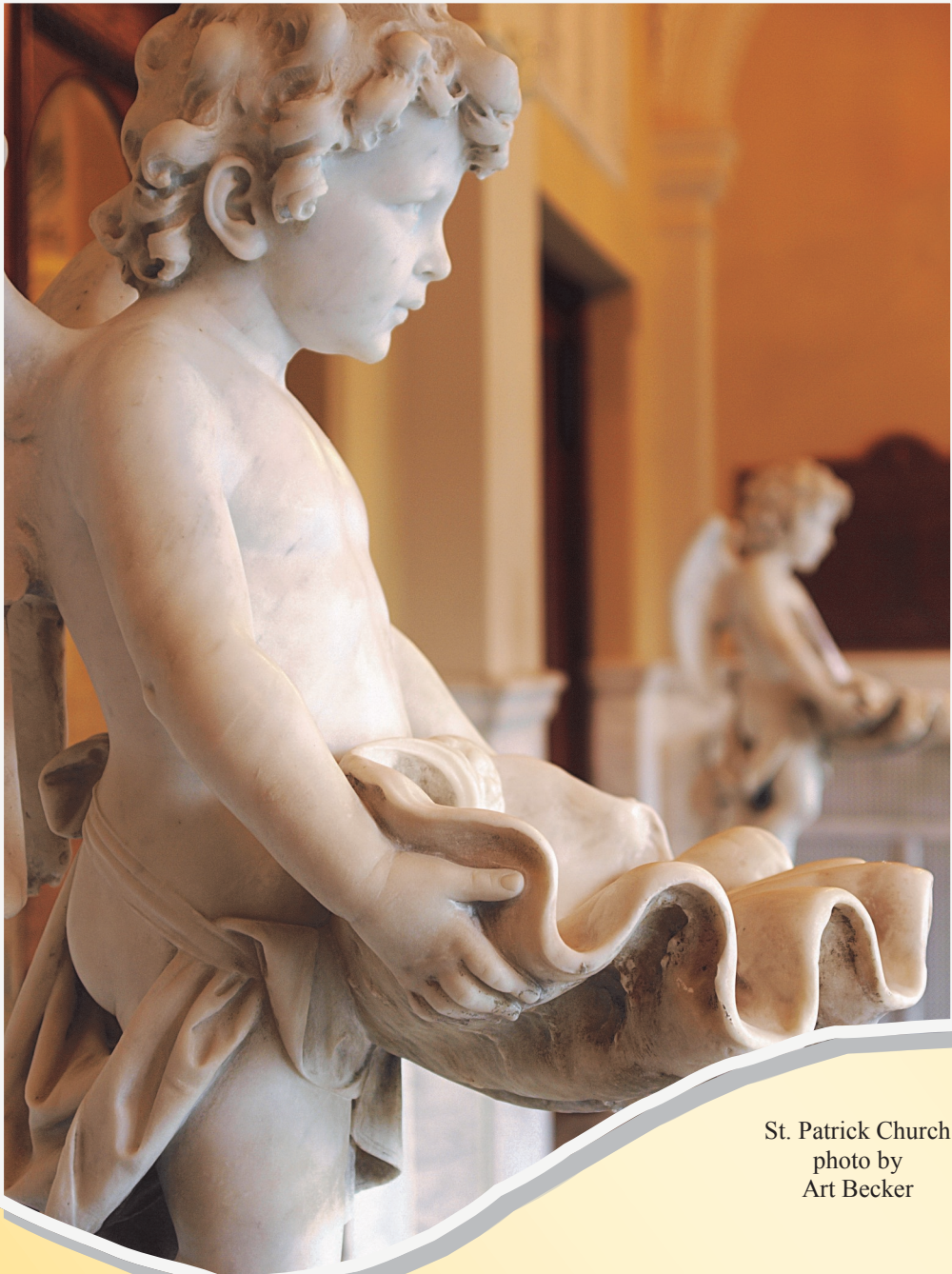
St. Patrick Church

Seventh Sunday in Ordinary Time February 24, 2019