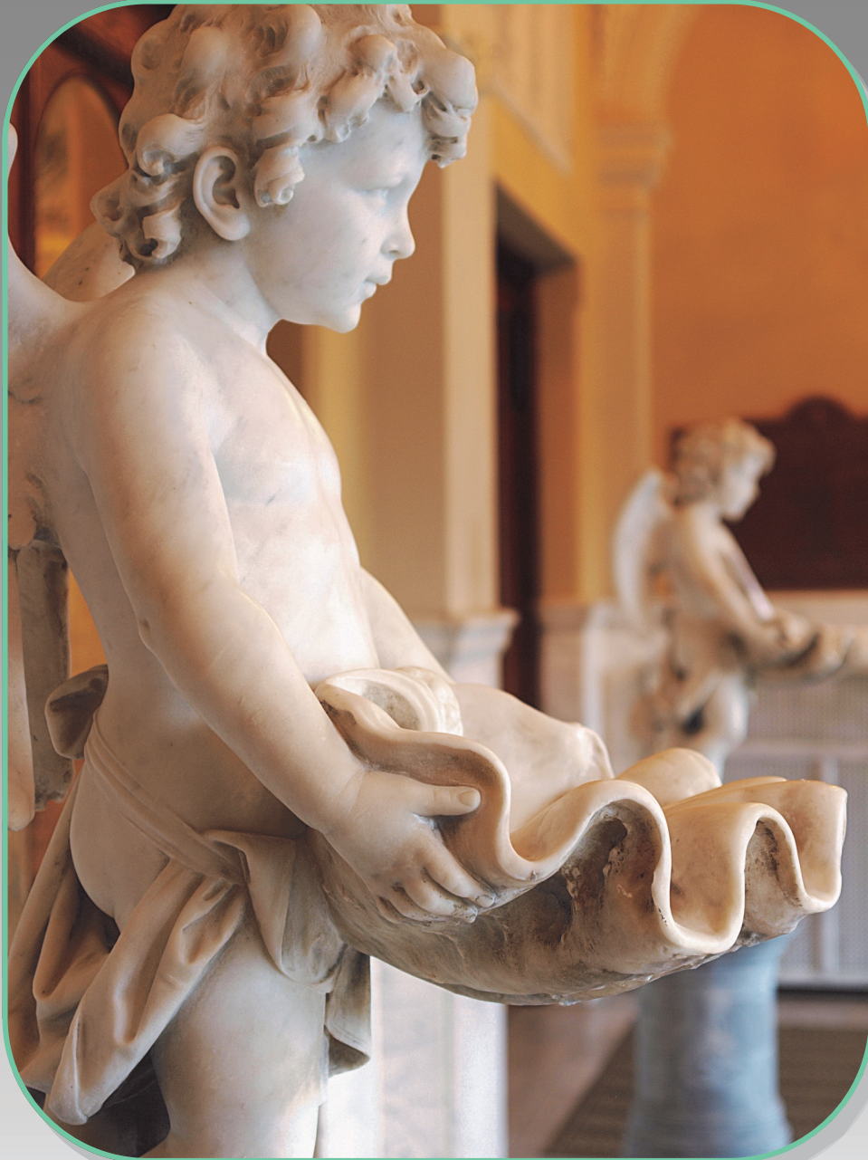
St. Patrick Church

Saint Patrick Parish Serving the East Bayfront of Erie since 1837 Daily Mass 8 AM Saturday Vigil Mass 5 PM Sunday 8 AM & 10:30 AM