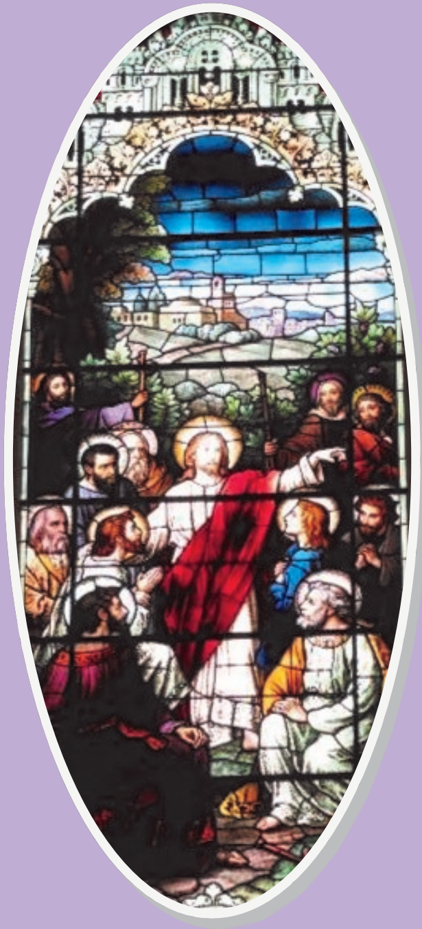
Jesus preaching to the Apostles