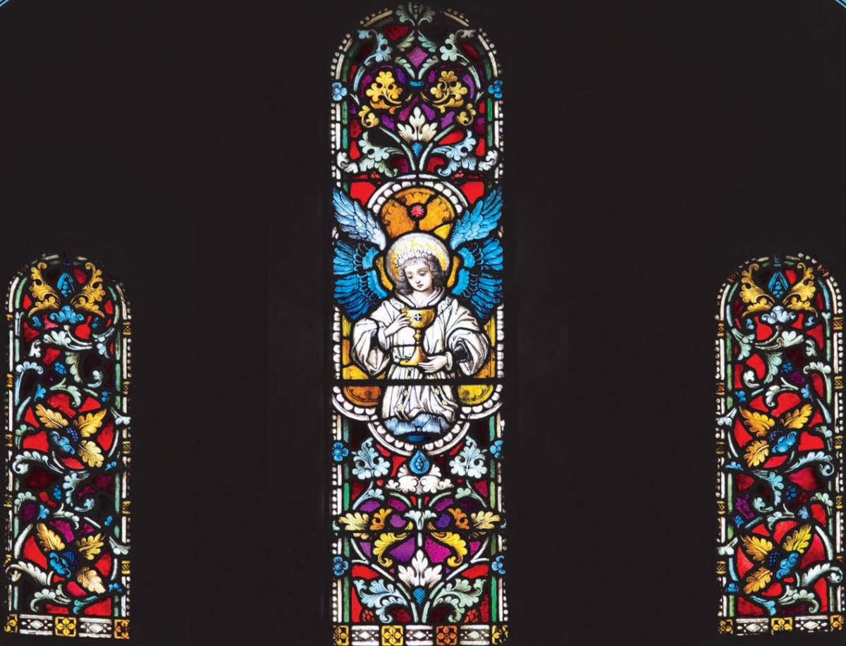
Stained Glass Window St. Patrick Church