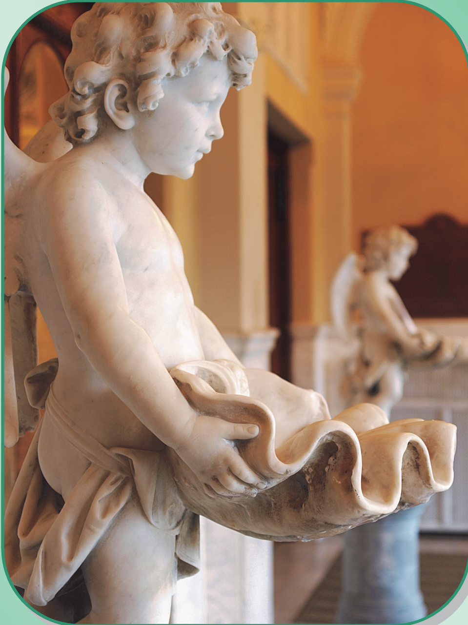
St. Patrick Church

Sixth Sunday in Ordinary Time February 11, 2018