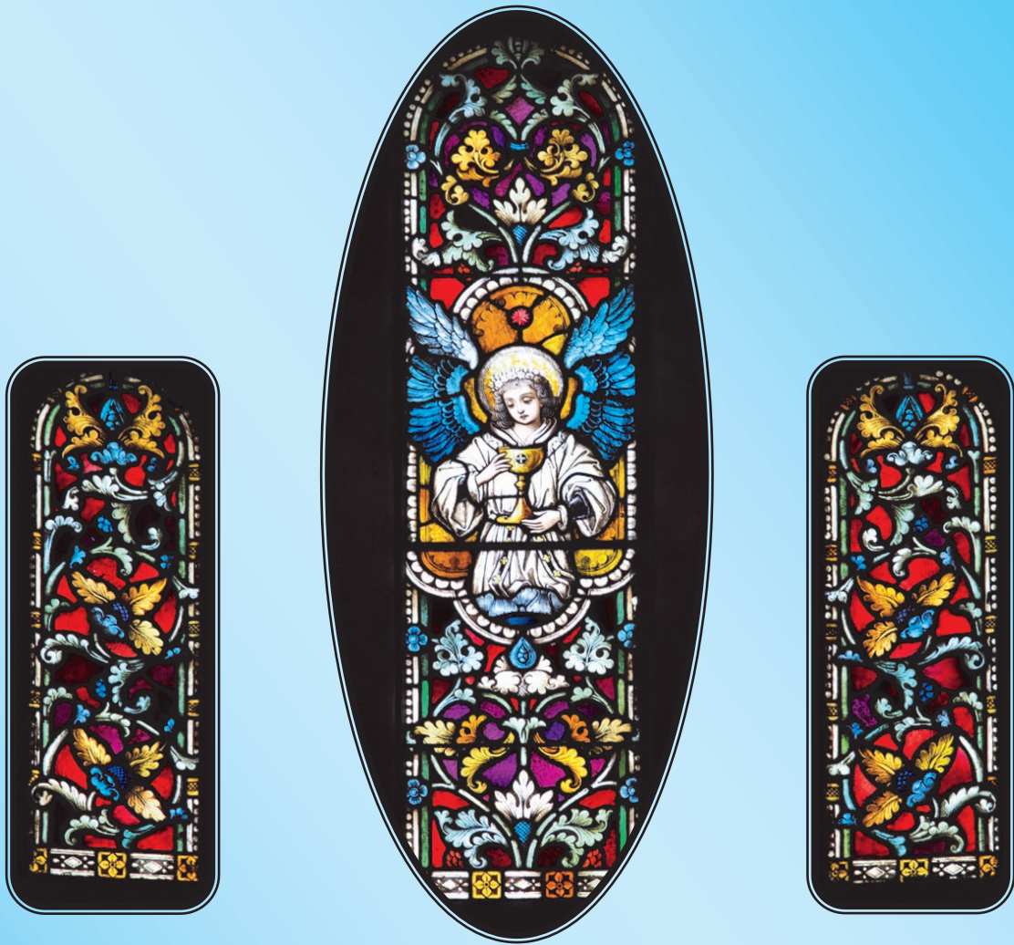
"Bread from Heaven" Stained Glass Window St. Patrick Church

Serving the East Bayfront of Erie since 1837