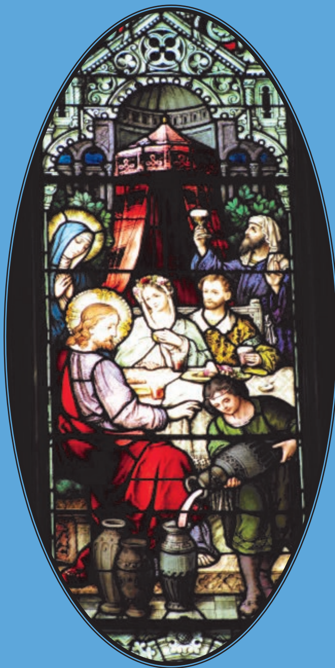
Wedding at Cana Stained Glass Window St. Patrick Church