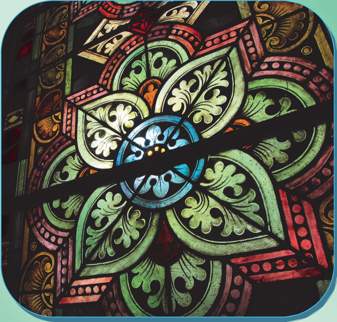
Stained Glass Window St. Patrick Church

Third Sunday in Ordinary Time January 27, 2019