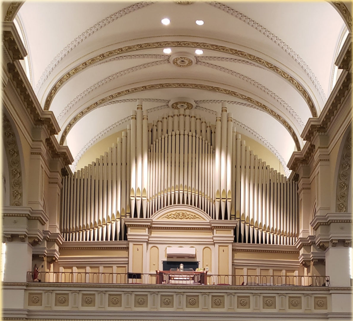
The Pipe Organ St. Patrick Church

Third Sunday in Ordinary Time January 26, 2020