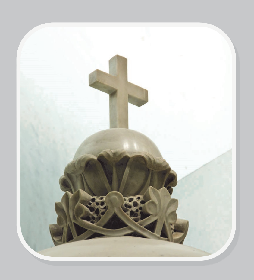
Cross on top of main Altar at St. Patrick Church