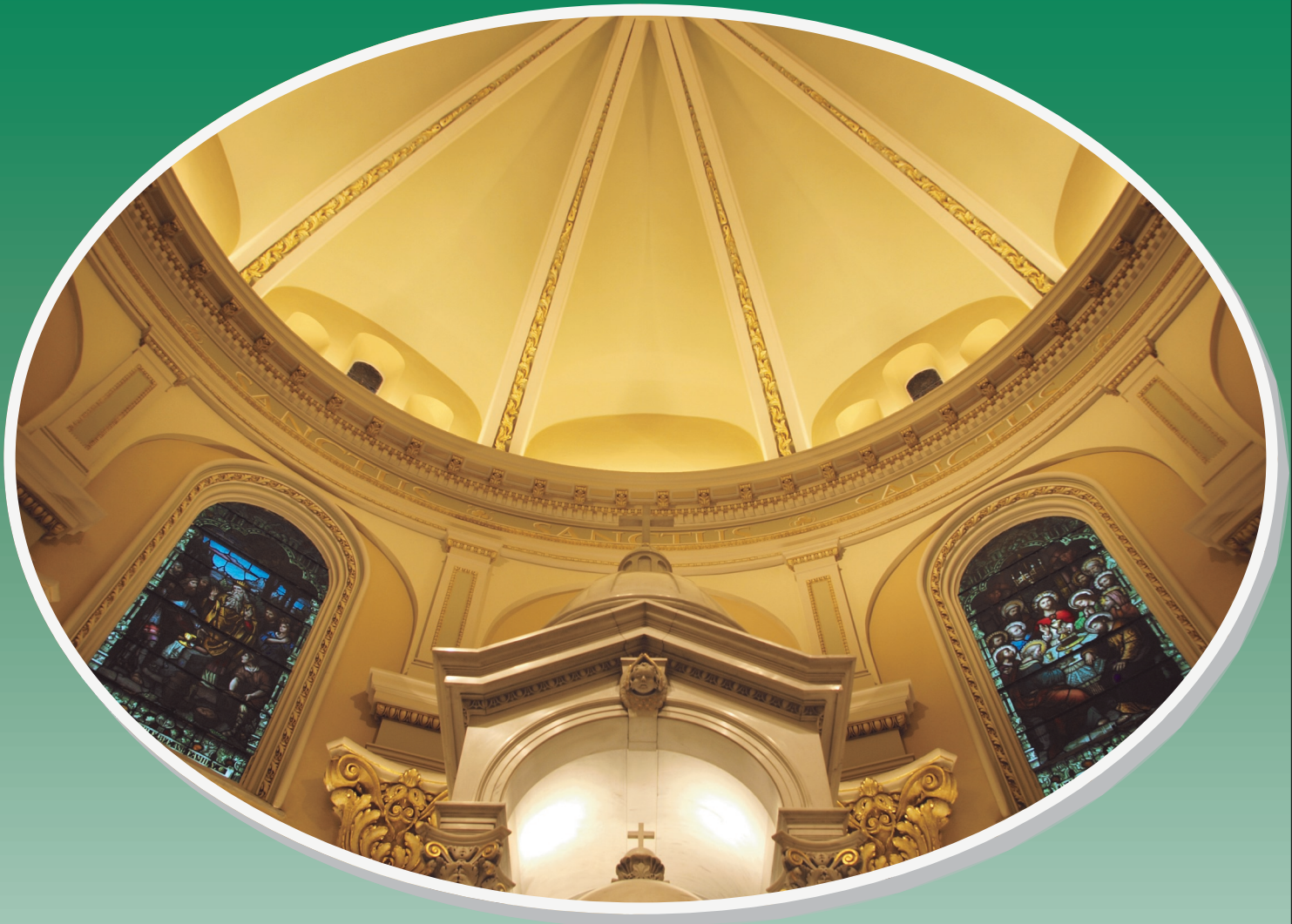
St. Patrick Church