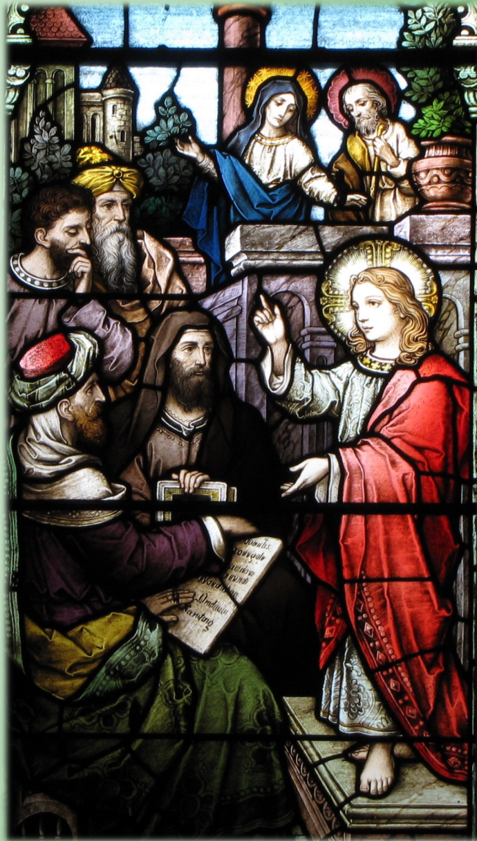
"Jesus Teaching in the Temple" Stained Glass Window St. Patrick Church