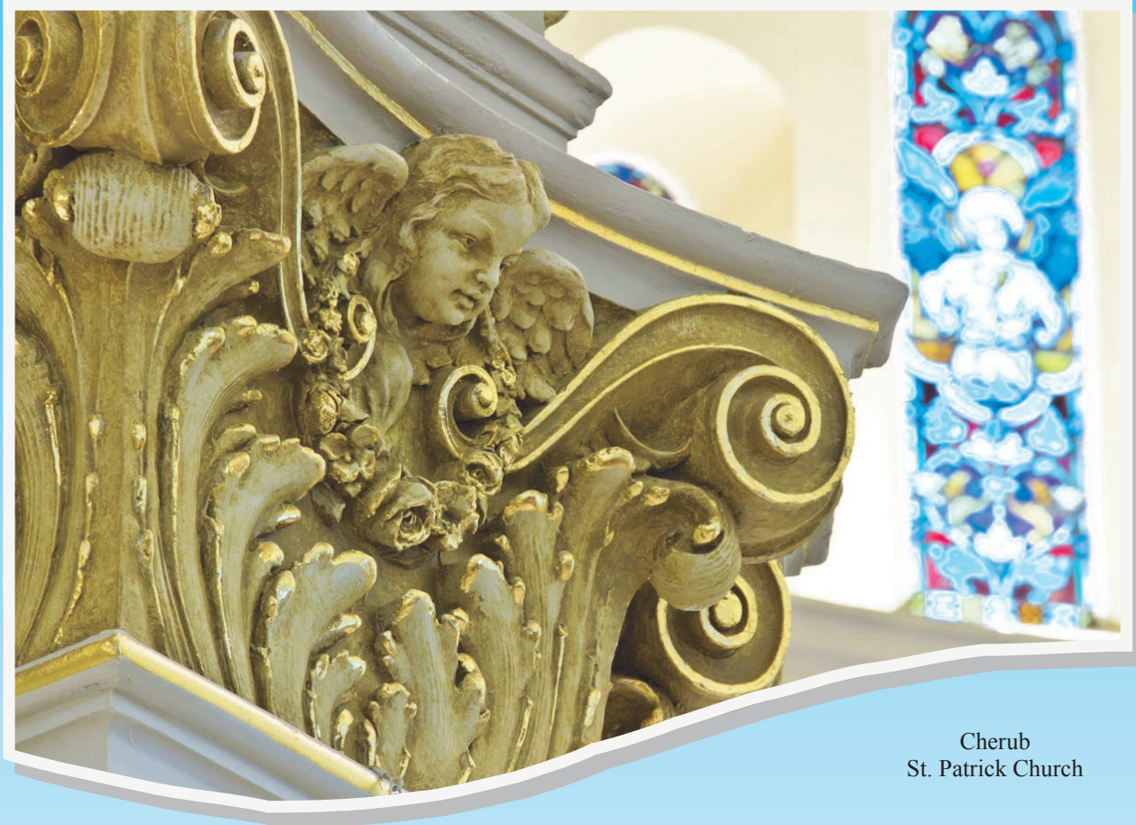
Cherub St. Patrick Church