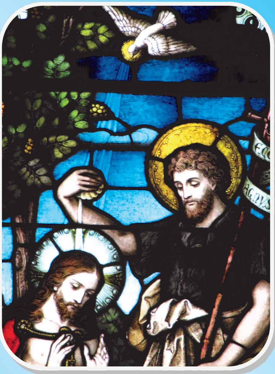
"The Baptism of the Lord" Stained Glass Window ~St. Patrick Church