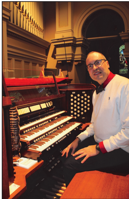
Christmas 2018 St. Patrick Church