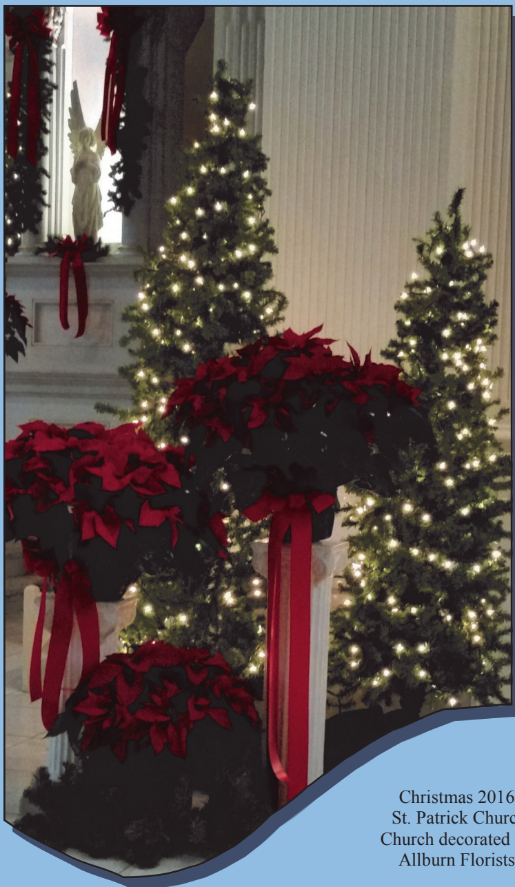
Christmas 2016 St. Patrick Church Church decorated by Allburn Florists