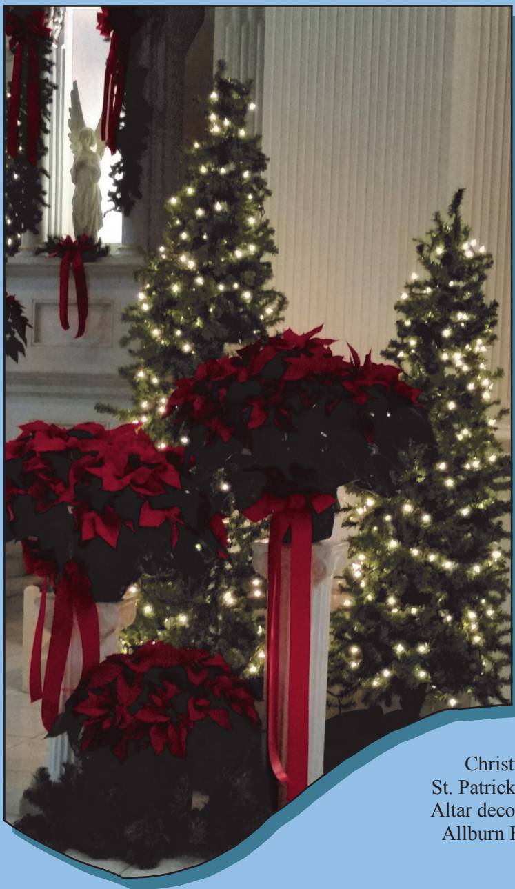
Christmas St. Patrick Church Altar decorated by Allburn Florists

Serving the East Bayfront of Erie since 1837