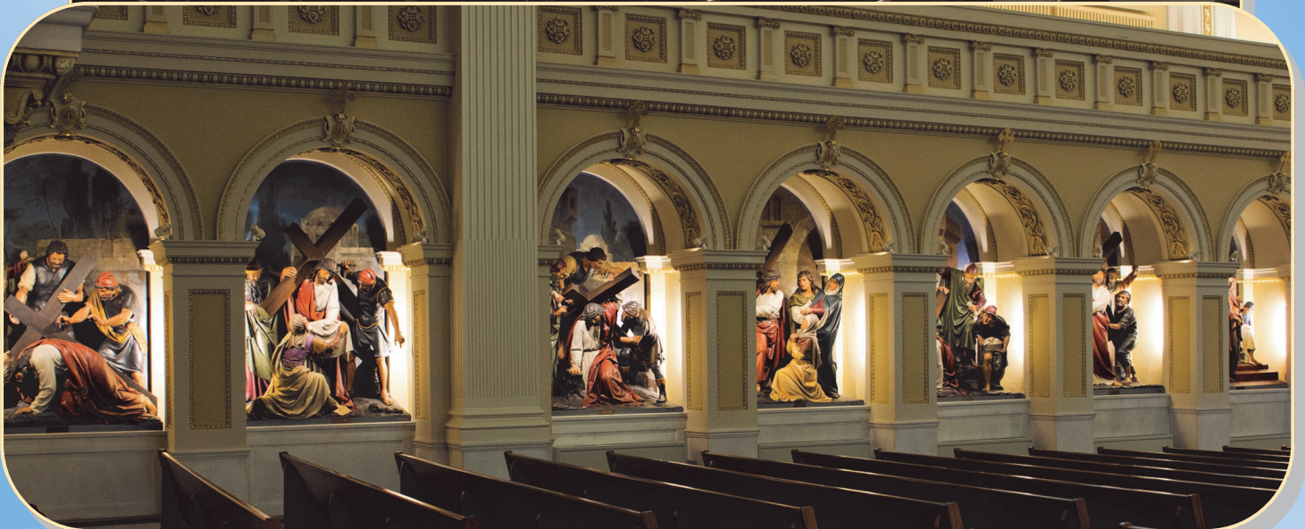
Stations of the Cross St. Patrick Church