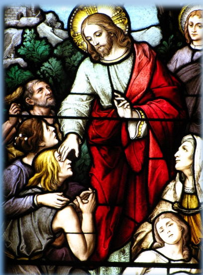
Healing the Blind Man