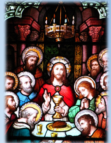
The Last Supper