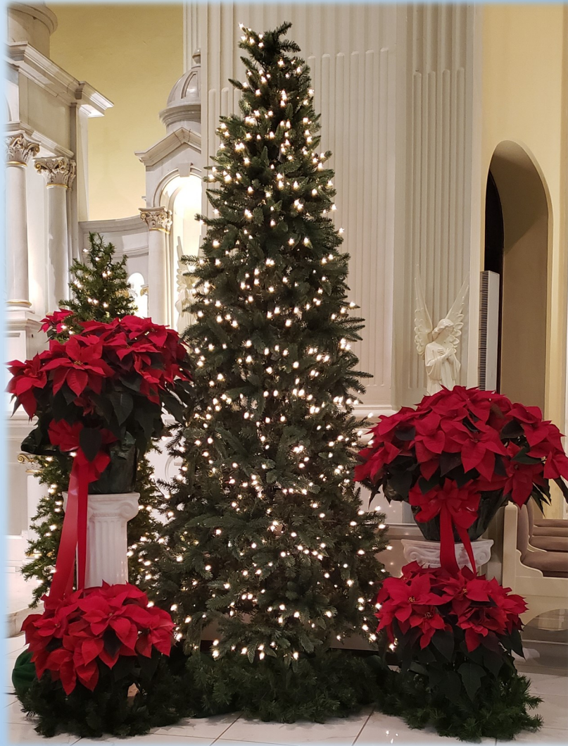
St. Patrick Church Christmas 2019

Saint Patrick Parish Serving the East Bayfront of Erie since 1837 Daily Mass: Monday-Thursday 8 AM Saturday Vigil Mass: 5 PM Sunday: 8 AM & 10:30 AM