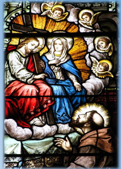
Visions of St. Francis