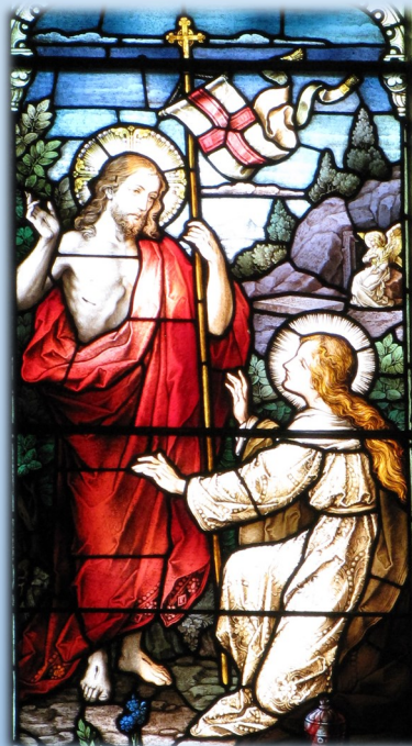
Jesus appears to Mary Magdalene