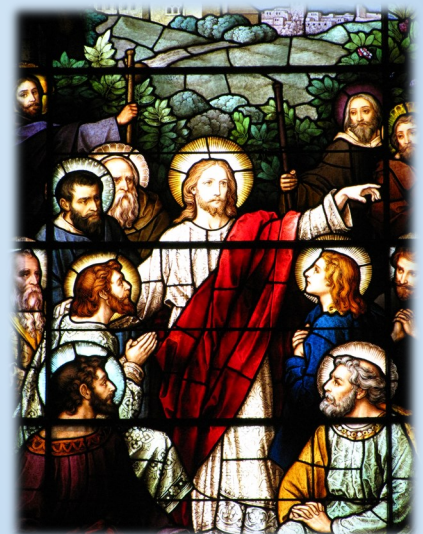
Sending the Apostles