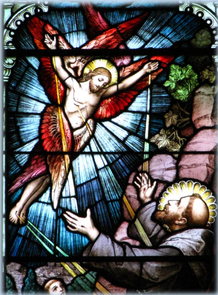
Stigmata of St. Francis