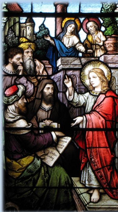
Stained Glass Windows St. Patrick Church