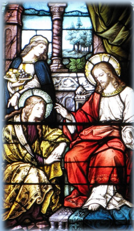
Mary has chosen the better