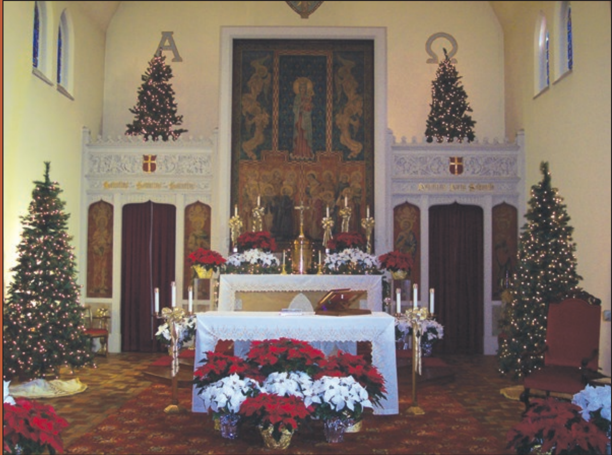
Christmas at St. Hedwig Church